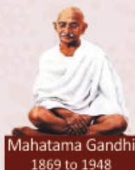
Mahatma Gandhi 1869 to 1948